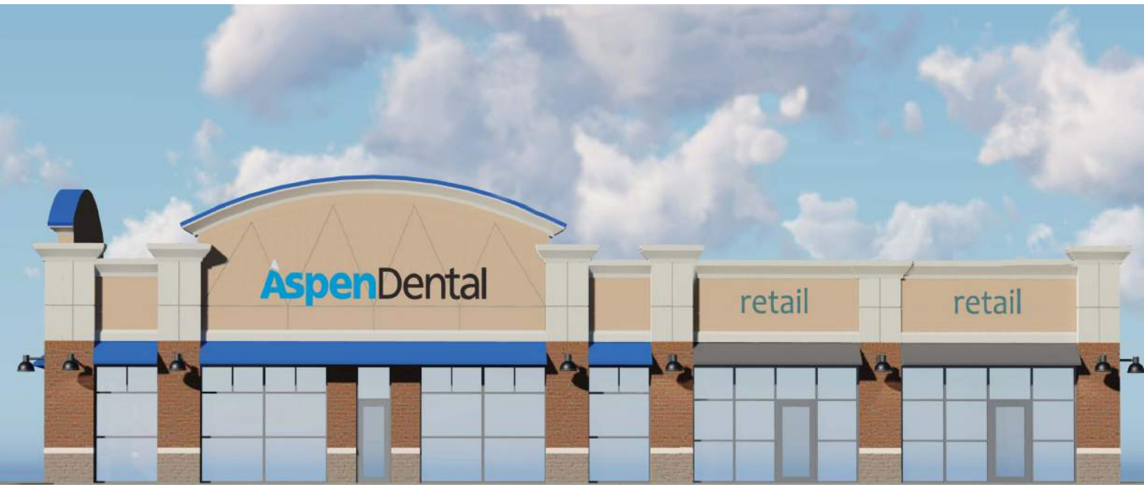
FRONT ELEVATION (SOUTH)