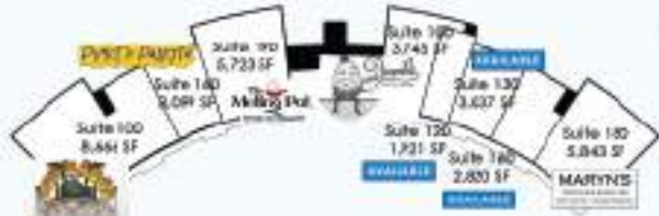
BLDG 300 FIRST FLOOR