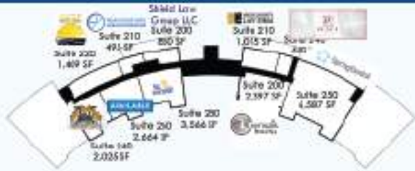
BLDG 300 SECOND FLOOR