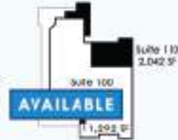
BLDG 1000 FIRST FLOOR