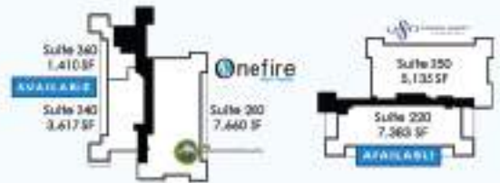
BLDG 1000 SECOND FLOOR