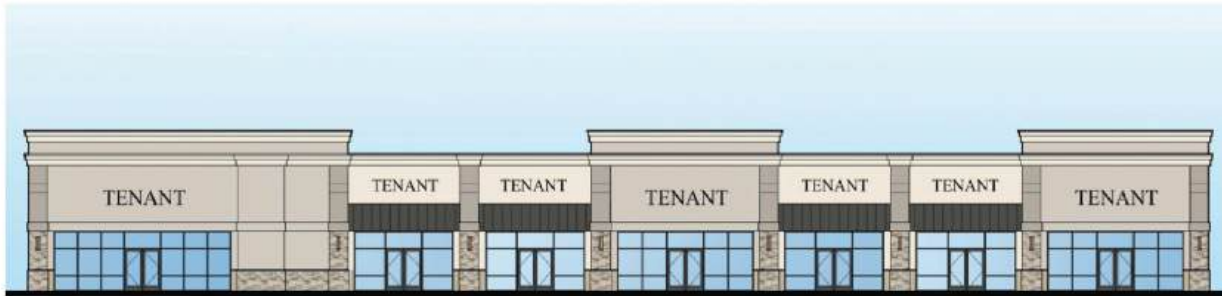
2 PROPOSED OVERALL BUILDING ELEVATION SCALE NTS