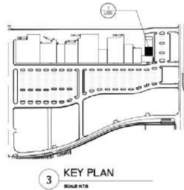
3 KEY PLAN SCALE NTS